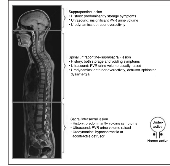
Fig. 1. Classification of lower urinary tract dysfunction based on level of lesion (adapted from Panicker et al<sup>7</sup>).